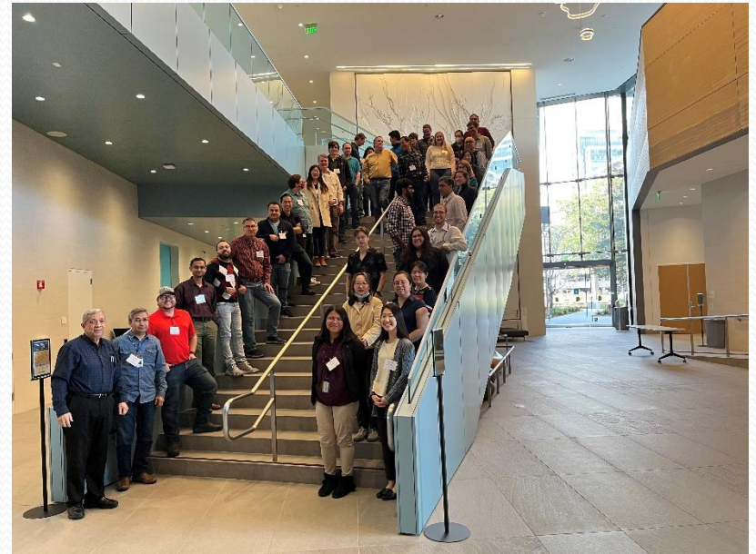
IWFM Training Workshop March 2023